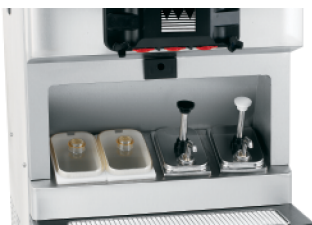
Integrated Syrup Rail Option

2 room temperature with lids & ladles, 2 heated with syrup pumps