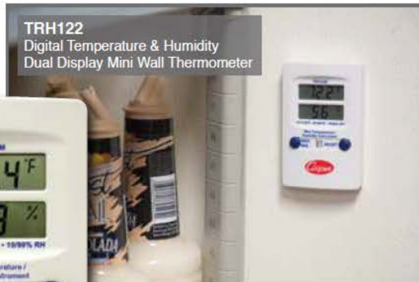
TRH122 Digital Temperature & Humidity Dual Display Mini Wall Thermometer

The TRH122M measures both temperature and % Relative Humidity. It features Min/Max memory and is °F/°C selectable.