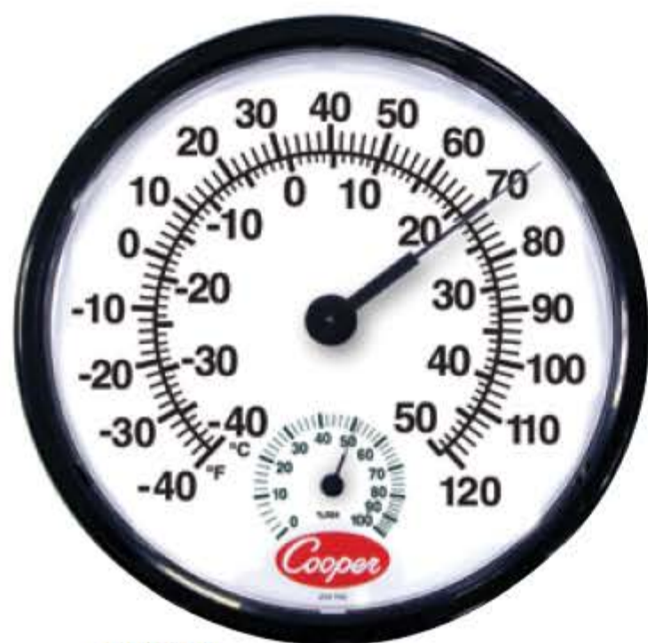
212-150 12" Wall Thermometer/Humidity Meter