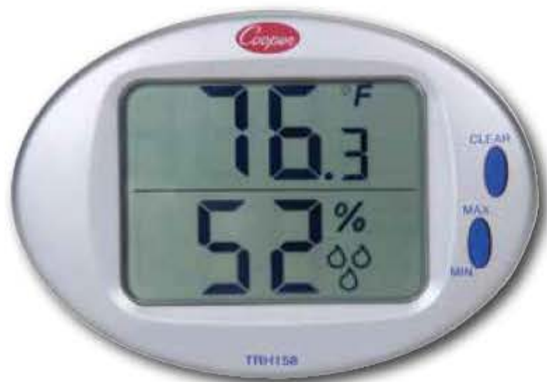
TRH158 Digital Temperature & Humidity Wall Thermometer

The TRH122M measures both temperature and % Relative Humidity. It features Min/Max memory and is °F/°C selectable.