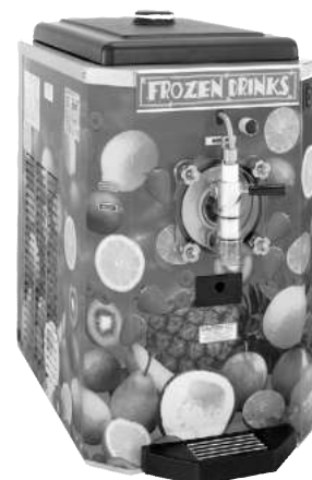
Shown with optional panel decals