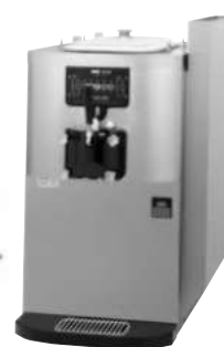
Optional Top Air Discharge Chute

Rockton, Illinois 61072 800-255-0626 Phone 815-624-8333 Fax 815-624-8000 www.taylor-company.com e-mail: info@taylor-company.com