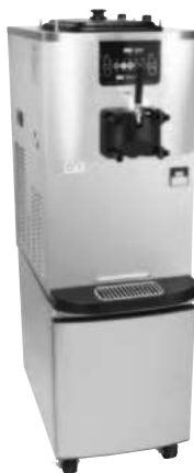
Optional Cart with front opening door

Hopper temperature is displayed to assure safe product temperatures. Indicator may be switched from Fahrenheit to Celsius temperature display.