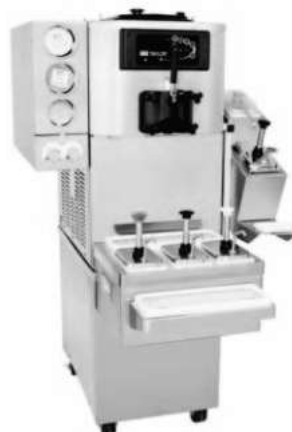
Optional Cart with rear door for front mount syrup rail