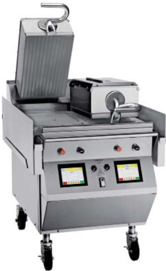
Model G820 Includes grooved upper platen.