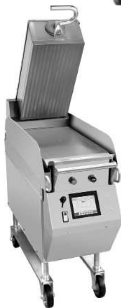
Model G828 Includes grooved upper platen.