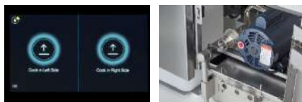
Full color touch and swipe control 8 gpm filter pump

Choose from 1, 2, 3, or 4-well, full or split vat configurations.