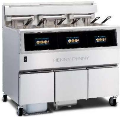
OFE 513 3-well open fryer

The Henny Penny F5 open fryer is designed from the ground up to make frying high-quality food easier, safer and more efficient for any kitchen.